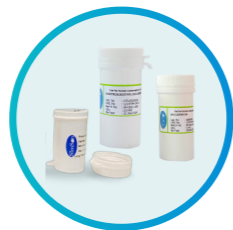
HDPE Bottles with Ice Gel Pack