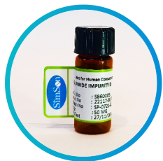
Glass & Amber Vials